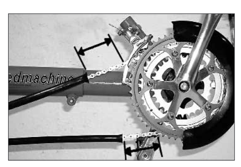
Check that there is at least a 5 cm (2") clearance between the end of the chain tube and other parts of the drive train.

Caution! Take care that the chain tubes have at least a clearance of 5 cm (2") to the rear derailleur and the front changer even under maximum tension of the chain and that the tubes stay tight in their fastenings. Shorten the tubes if necessary. If the end of the chain tube gets into the rotating drive train it could be locked-up and destroyed. The end of the rear chain tube has to be tightly secured with a cable tie behind the retention spring.